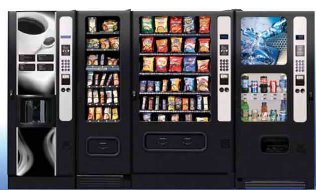
Full Line Vending Products & Services